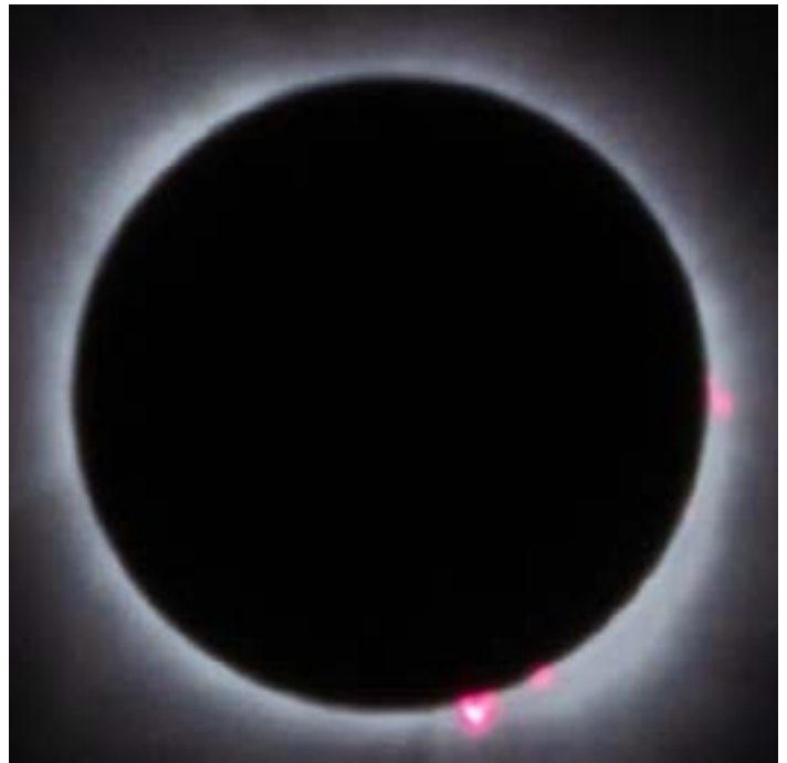
Total Solar Eclipse in Missouri

Teaching some of the brightest students at UF and watching them develop into our industry leaders.