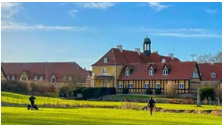
Pheasant Hunt in Denmark