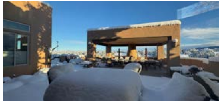
Rear yard of Casa Smerage in Santa Fe on 8 November 2024 after early snow.

Domestic and international travels continue. In 2024, road trips took us to New Orleans, Texas, Arizona, California, and the Tetons. There were a two week cruise around the Baltic Sea, a week in Stockholm, and visits to family in Richmond and Des Moines.