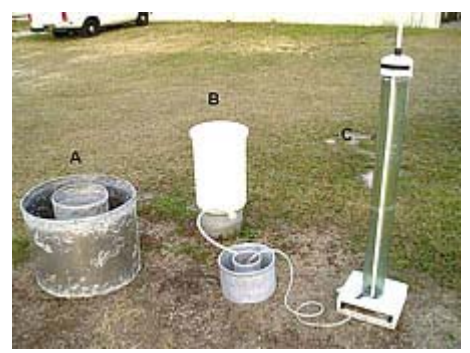
Fig. 1. Photograph of (A) 30-cm diameter (inner) and 60-cm diameter (outer) double-ring infiltrometer (B) 15-cm diameter (inner) and 30-cm diameter (outer) double-ring infiltrometer, and (C) Mariotte siphon developed to maintain a constant inner head in the infiltration rings.

A total of eight tests in different locations within the experimental site were conducted using method (A), which followed the procedure set out by the ASTM standard. Nine infiltration tests each were conducted using methods (B) and (C). One fewer of the method (A) tests was conducted because substantially more water was required for this test compared to the smaller rings and not enough water was available to run the final test with the large rings.